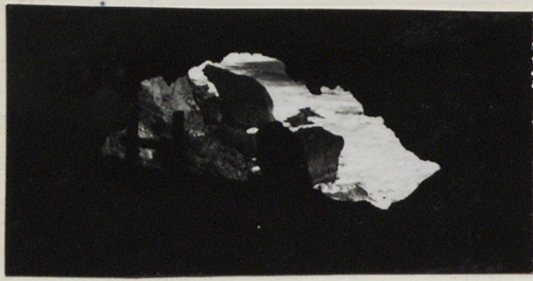
Mouth of cave